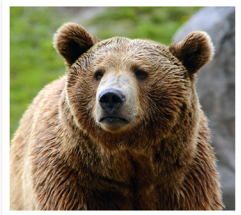
Brown bears are mammals.

Animals can be sorted into six different groups. These are mammals, amphibians, birds, fish, reptiles and invertebrates.