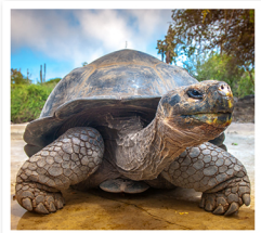
Tortoises are reptiles.