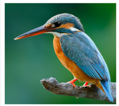
Kingfishers are birds.