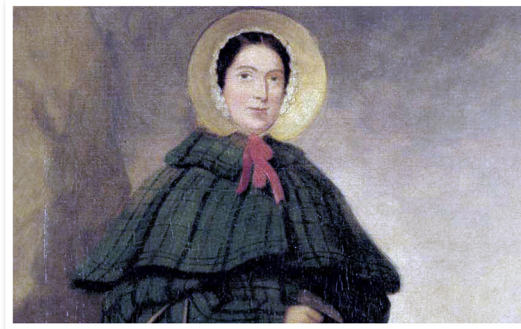
Portrait of Mary Anning

Mary Anning was a British palaeontologist, who was born in 1799. She made many important fossil discoveries.