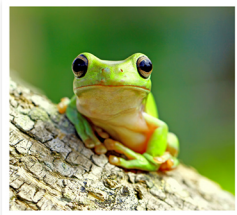
Frogs are amphibians.