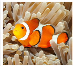
Clownfish are fish.