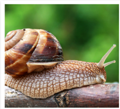
Snails are invertebrates.