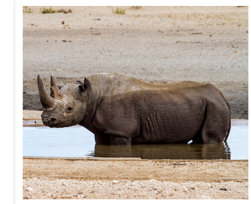
Western black rhino